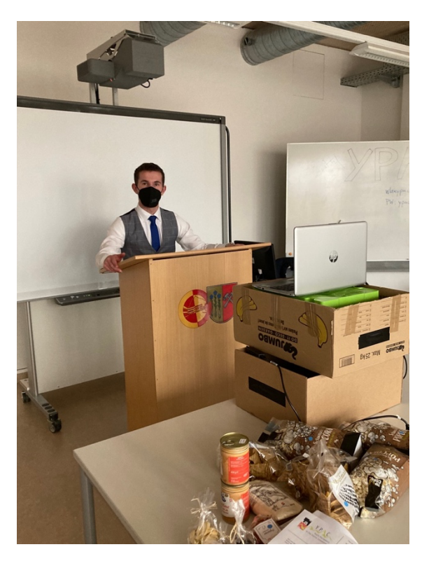
The YPAC Presidents